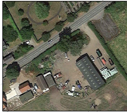
NORTH SOUTH AERIAL VIEW