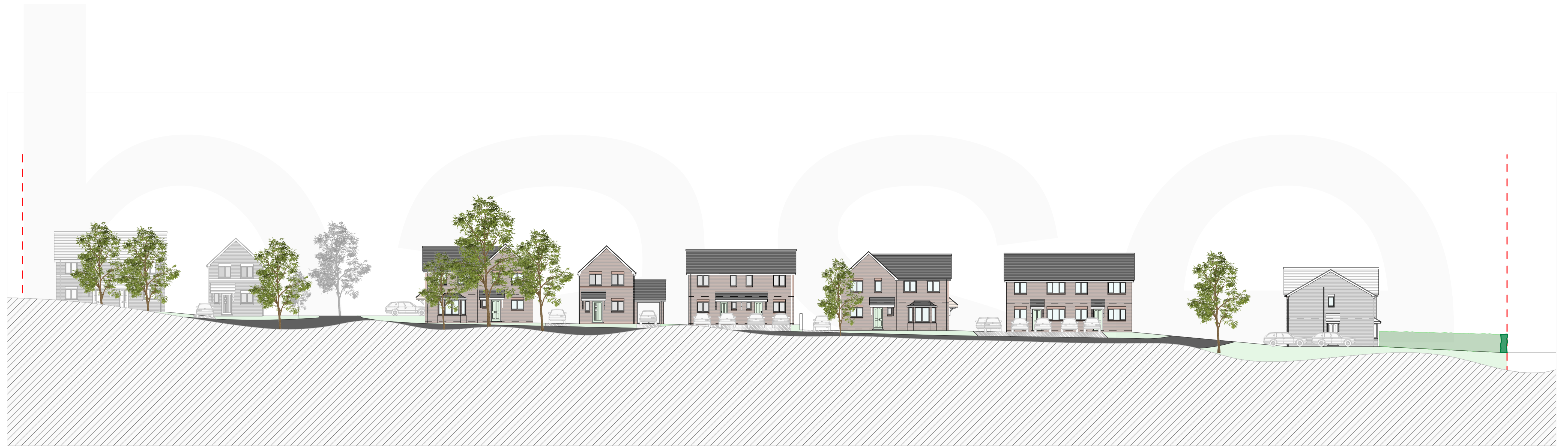
ELEVATION 01 - Proposed Street scene from Ruthan Road